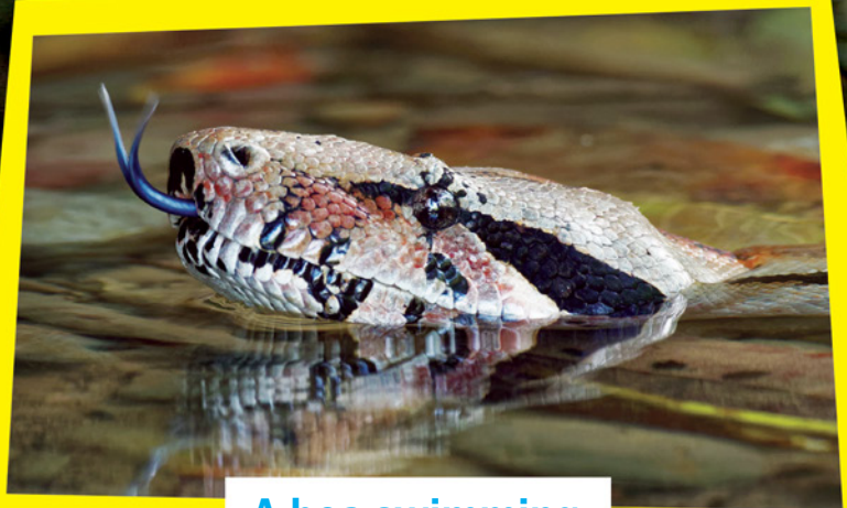
A boa swimming