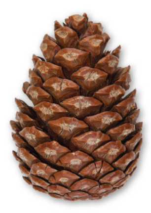
A cone with closed scales

Find some pine cones with open scales in a park or your backyard. The patterns in this project are for cones that are about 3 inches (7.5 cm) tall.