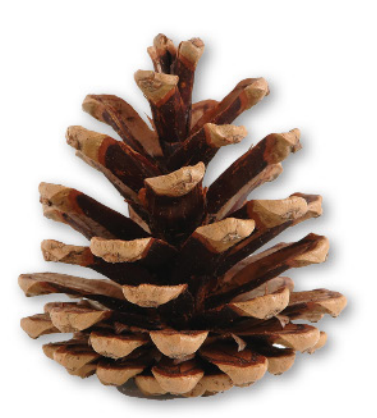
A cone with open scales