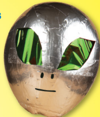
An alien head that you can wear as part of a costume ▶