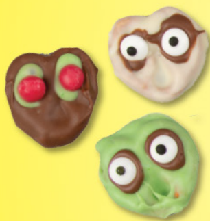
◀ Chocolate-covered alien pretzel treats