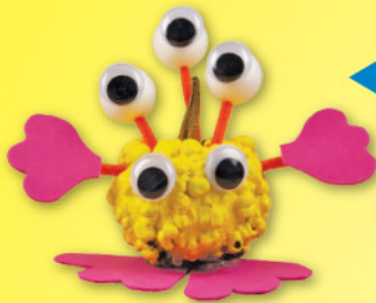
◀ Lumpy, googly-eyed alien decorations

Let's get ready to make some creepy creatures from outer space—aliens! This book shows you how to make the following: