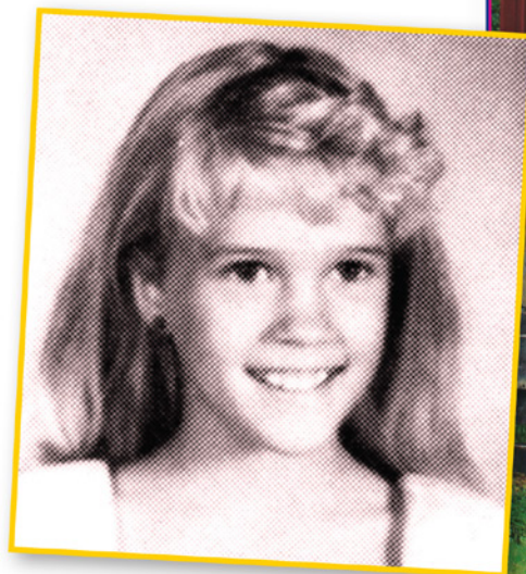
Carrie in third grade

Carrie Marie Underwood was born on March 10, 1983, in Muskogee, Oklahoma. Carrie grew up on a farm with lots of animals. "I enjoyed things like playing on dirt roads, climbing trees . . . and, of course, singing," Carrie said. She loved country life.