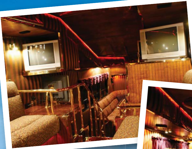
Inside The Midnight Rider