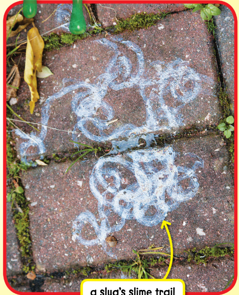
a slug's slime trail

What is slime, and how do you think it is helpful to a slug?