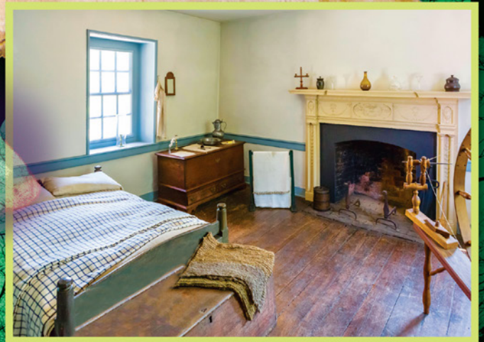
A bedroom in the Old Stone House

Yet the Old Stone House is more than a piece of the past. It's also said to be home to many spirits ! One of them is a savage ghost named George.