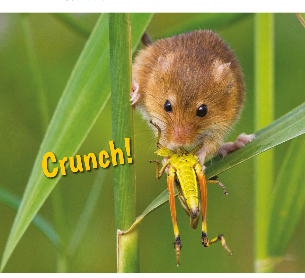
She catches and eats a grasshopper.