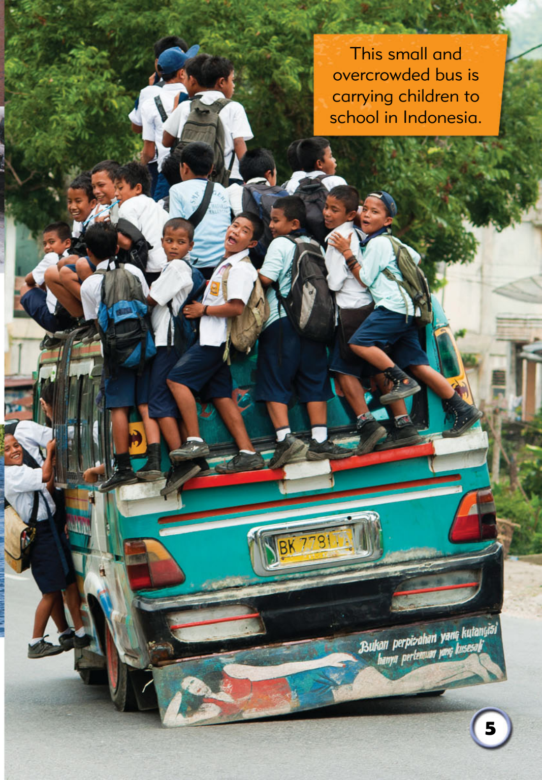
This small and overcrowded bus is carrying children to school in Indonesia.

These students in Myanmar travel to and from school by boat.