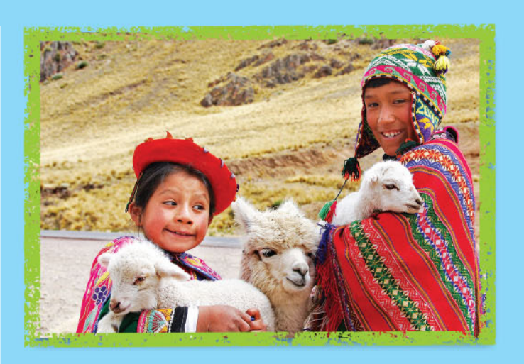
The picture on the front cover of this book shows Quechua children from Peru. Turn to page 8 to find out more about the colorful clothes they are wearing.

For further information including rights and permissions requests, please contact our Customer Service Department at 877-337-8577.