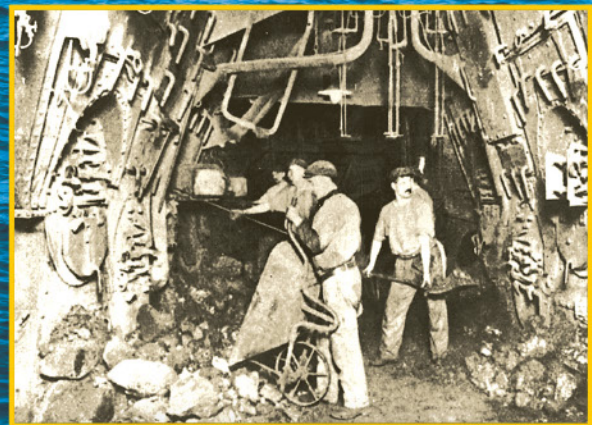
Workers in one of Titanic's boiler rooms

The Titanic had six boiler rooms that held a total of 29 boilers. Workers shoveled coal into the boilers, where it was burned to provide power for the ship.