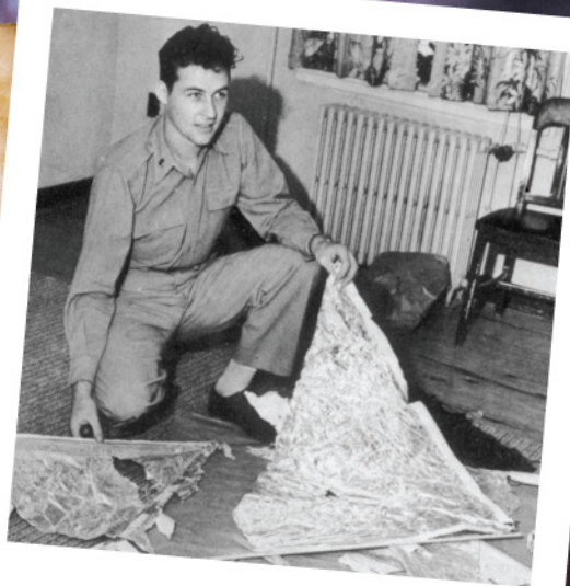
Objects from the wreckage

Then the officials made a startling announcement: the remains were from a flying disc!