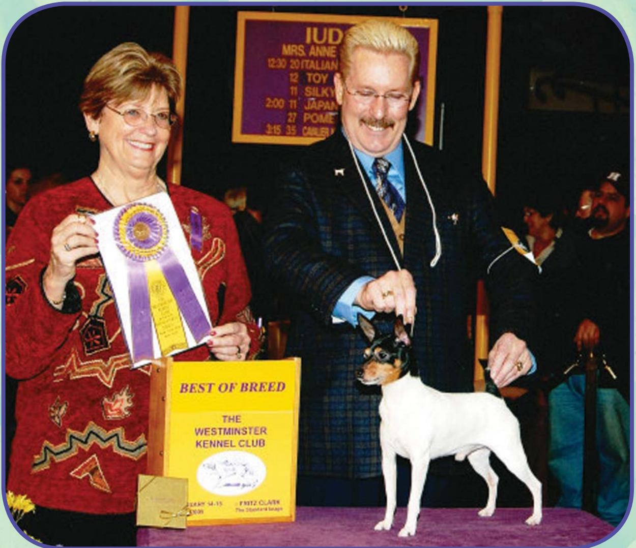
▲ Valcopy Butch Cassidy

The Best of Breed prize was a big honor for Kasey. Yet he wasn't the first member of his family to win the award. His father, Valcopy Butch Cassidy, had taken the same prize at Westminster four years earlier, in 2004. That's a family of champions!