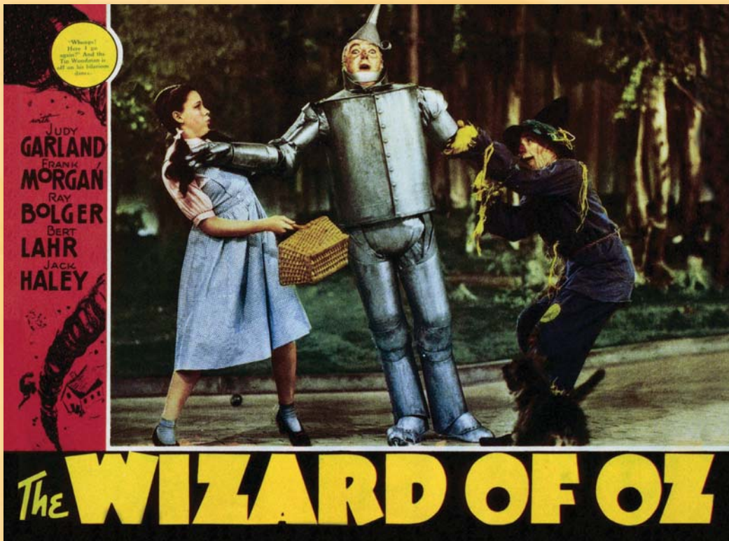
◀ A movie poster from the film The Wizard of Oz

The new film was called The Wizard of Oz . Terry would be playing the role of Toto. Little did she know that she was about to become the most famous Cairn terrier of all time!