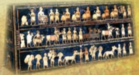
This beautiful box was found in the royal burial ground.