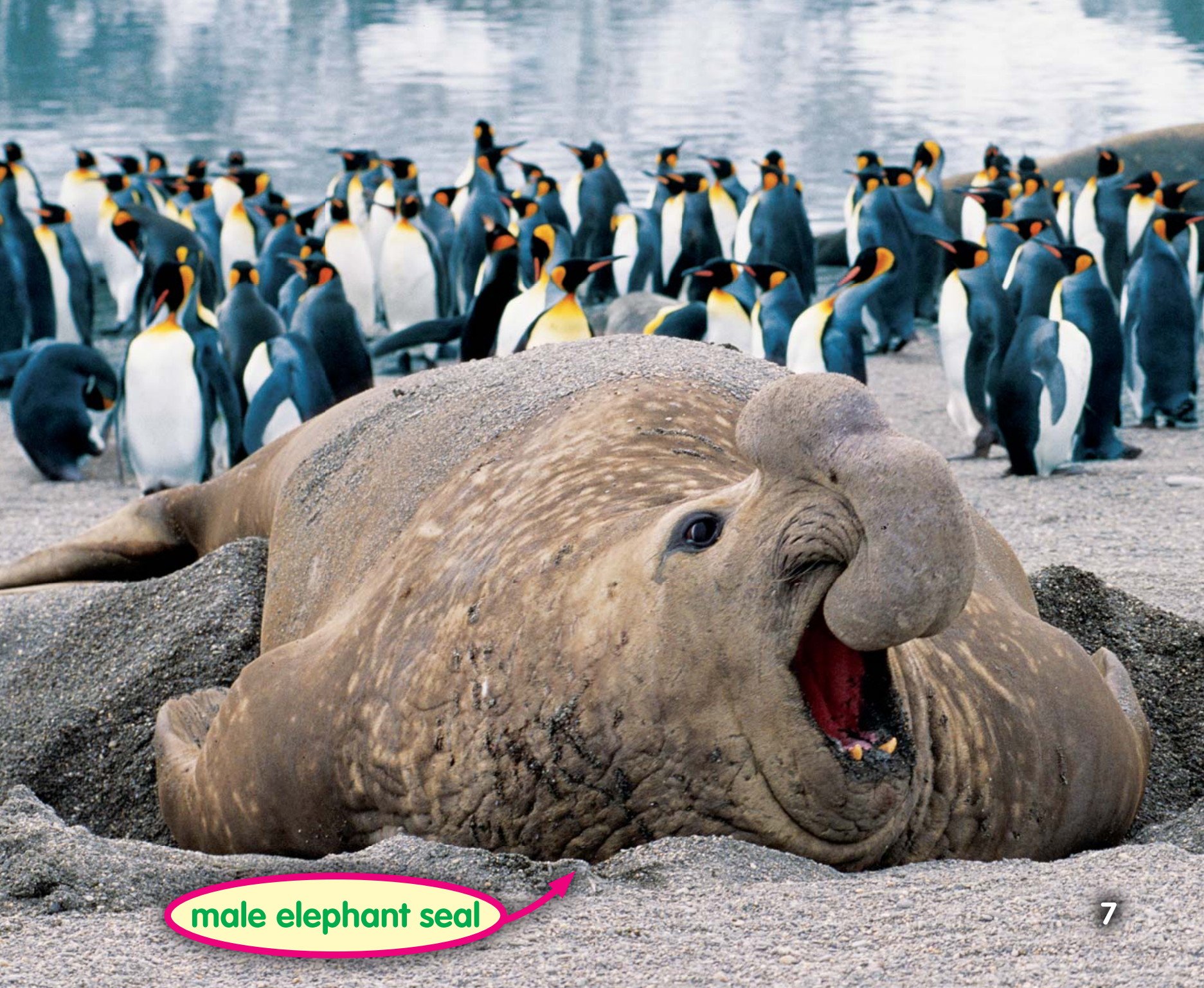
male elephant seal