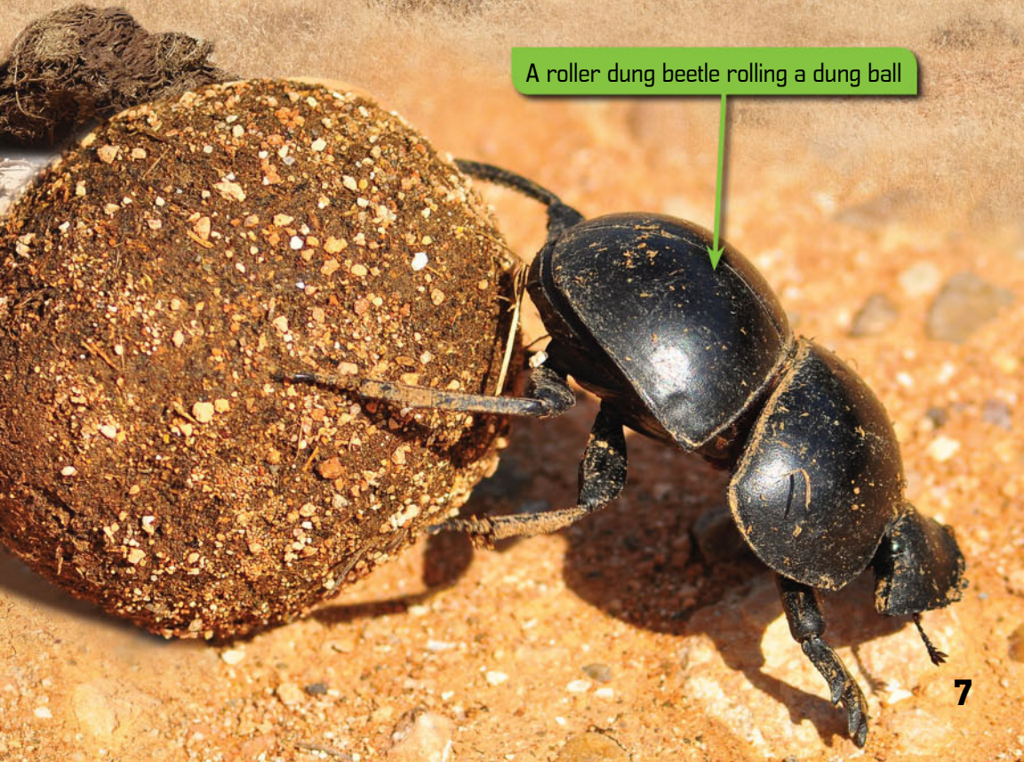
A roller dung beetle rolling a dung ball