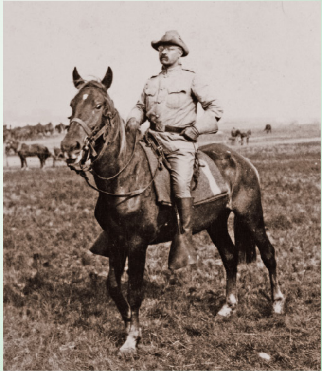
Theodore Roosevelt was known as a strong leader.

Theodore Roosevelt was always taking action. As a boy, he worked hard to make himself healthy. As president, he worked to make the country stronger. He also made it a better place for all Americans to live.