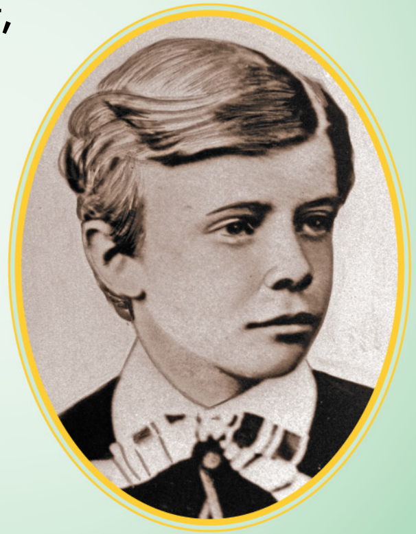
Theodore's family nicknamed him "Teedie."

Theodore Roosevelt was born in 1858 in New York. As a child, he had very bad asthma . Sometimes he even had to go to the hospital. Theodore exercised a lot, however. He also spent lots of time outdoors. He became stronger. This helped him overcome his illness.