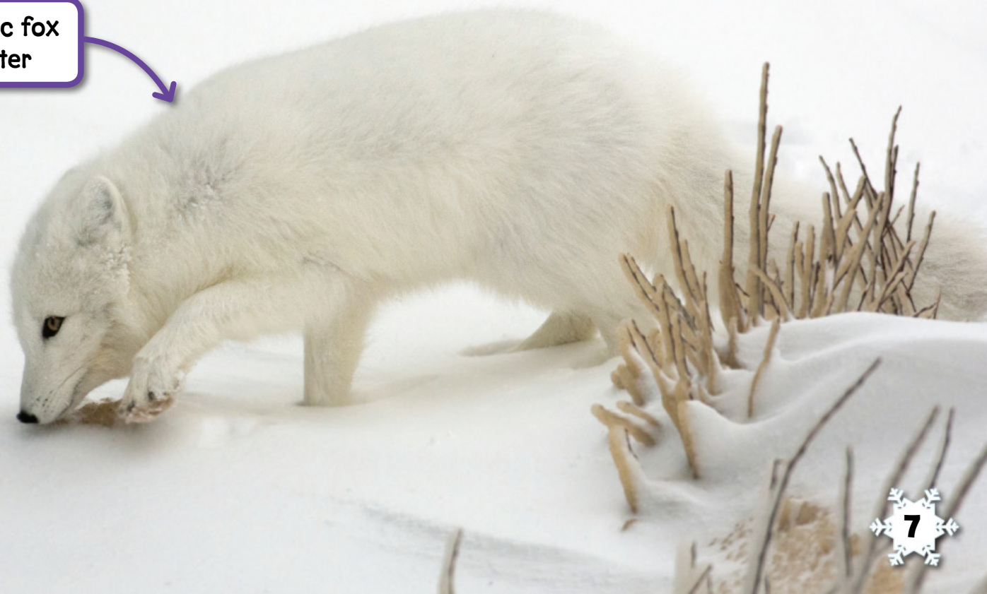
an arctic fox in winter