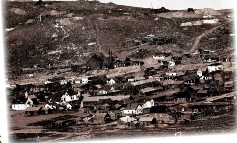
Bodie, around 1890

On July 4th, 1880, Bodie, California, was a lively, noisy place. Citizens of the town crowded onto Main Street to celebrate the holiday. Among them were prospectors , miners, gamblers, and even gunfighters. They were from many different places—from Chicago to China—but they all had something in common. They had come to this dusty, remote spot in the mountains to find gold.