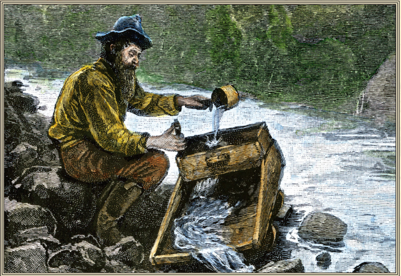
A man searches for gold in a river during the California Gold Rush.

For most of the 1800s, there was no town of Bodie—only empty, rocky land. In 1848, however, something happened that would change life in many parts of California. Gold was discovered. As a result, more than 300,000 people arrived in the area in a flood of activity that became known as the California Gold Rush. One of them was W. S. Bodey, a businessman from New York.