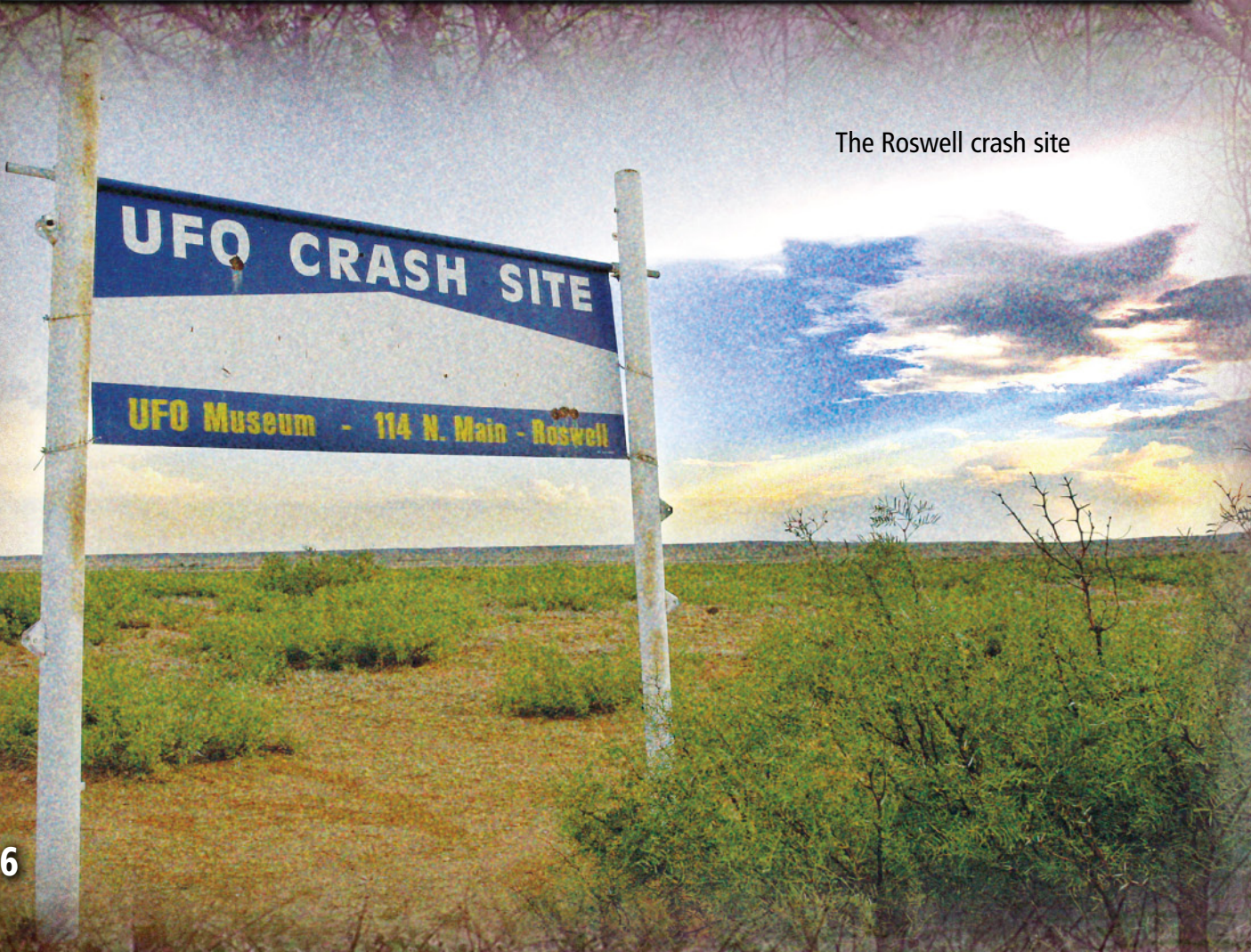
The Roswell crash site