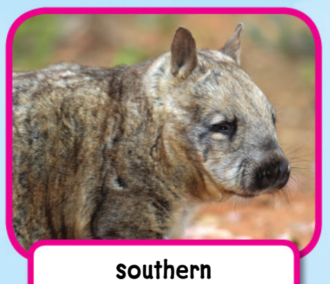
southern hairy-nosed wombat