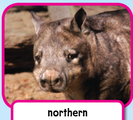
northern hairy-nosed wombat