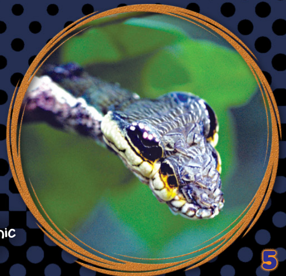
Snake mimic caterpillar