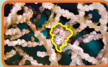
2) A fish called a pygmy seahorse