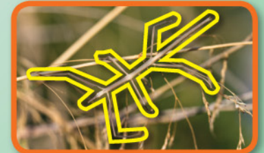
4) An insect called a walking stick