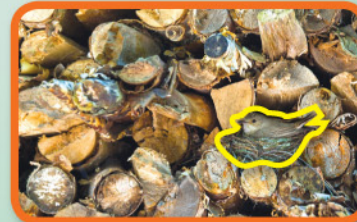
3) A bird called a spotted flycatcher