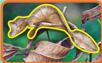
1) A lizard called a leaf-tailed gecko