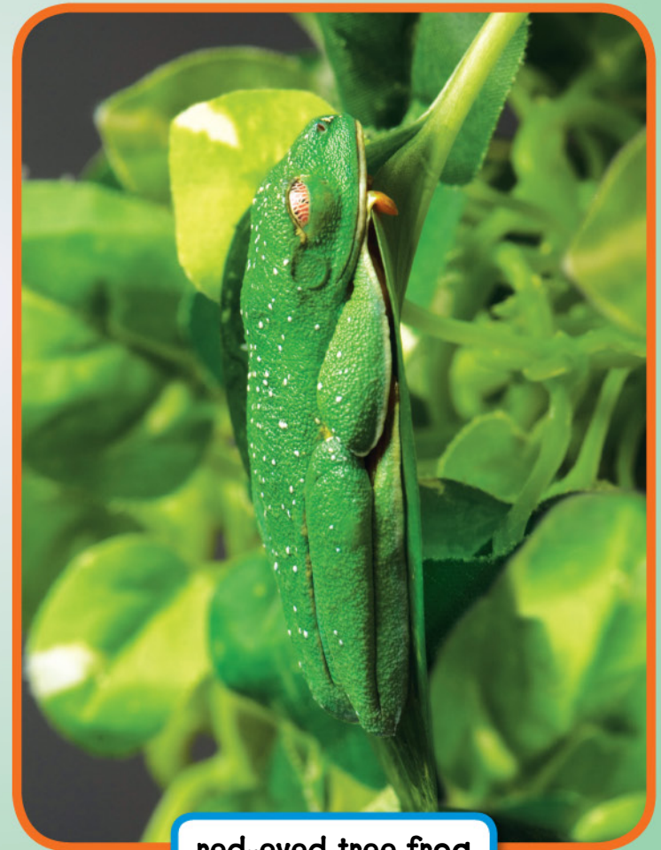
red-eyed tree frog

The colorful animal is a red-eyed tree frog, and it is ready to go hunting.