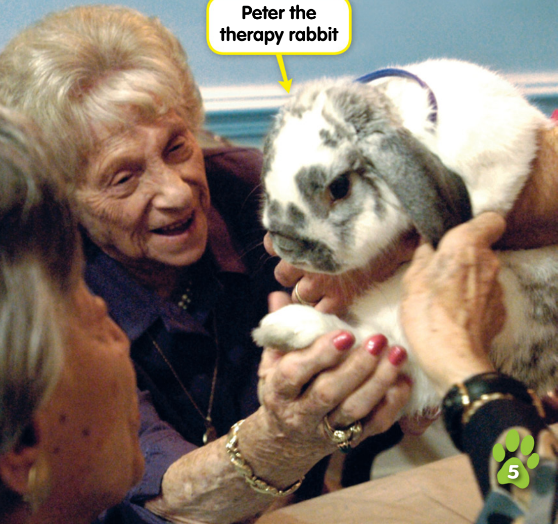
Peter the therapy rabbit

Petting and playing with Peter can cheer them up.