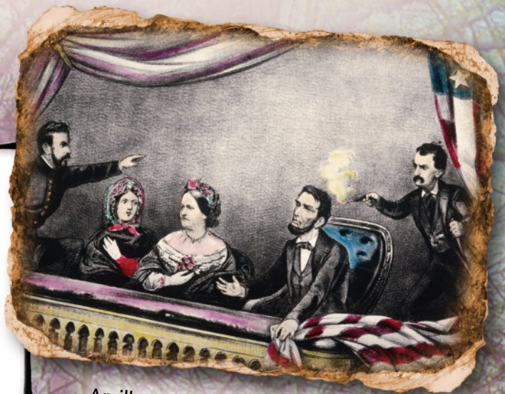
An illustration of the assassination of Abraham Lincoln at Ford's Theatre