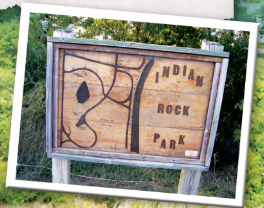
Indian Rock Pond in warmer weather