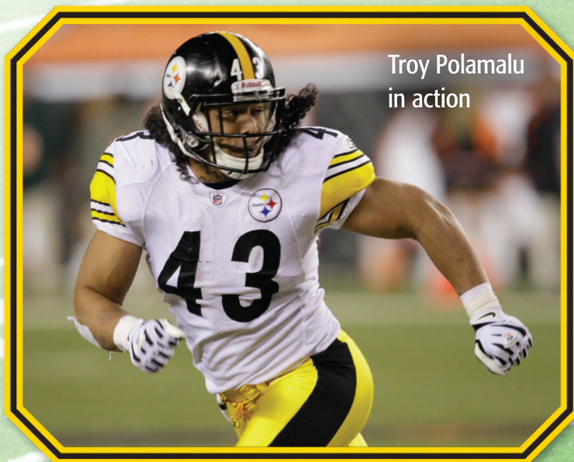
Troy Polamalu in action

With fewer than five minutes left to play, a 10–6 lead, and possession of the ball, Baltimore quarterback Joe Flacco had his team close to victory. To turn this game around, Pittsburgh needed a big defensive play. So they looked to safety Troy Polamalu—one of the NFL's greatest defenders .