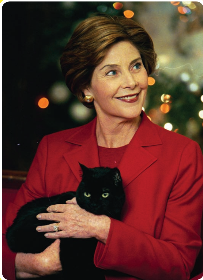
India, shown here with President Bush's wife, Laura, moved into the White House in 2001. Sadly, India passed away in January 2009 at the age of 18.

Living in the White House was a great place for doing what India liked to do best—play hide-and-seek. The 132 rooms provided her with lots of great places to hide. It also made it very hard for her owners to find her. When she was done playing, the little black cat would curl up under a bed in one of the 16 White House bedrooms. Like all American shorthairs, India was a very special kind of cat.