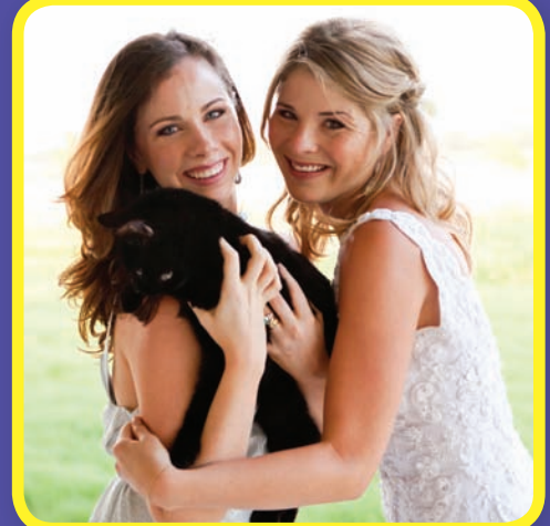
President Bush's daughters, Barbara (left) and Jenna (right), pose with India at Jenna's wedding.