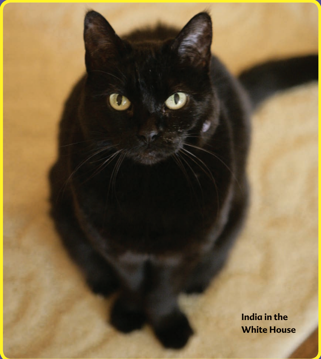
India in the White House

From 2001 to 2009, a very special four-legged furball lived in the White House with President George W. Bush and his family. India, a black American shorthair, was a very important member of the First Family .