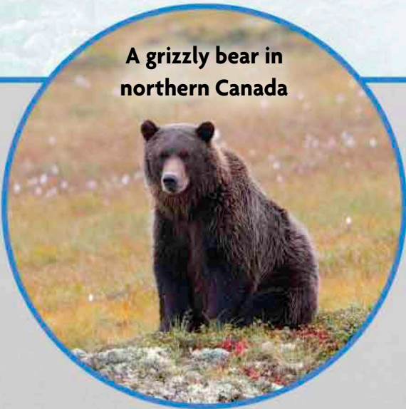
A grizzly bear in northern Canada