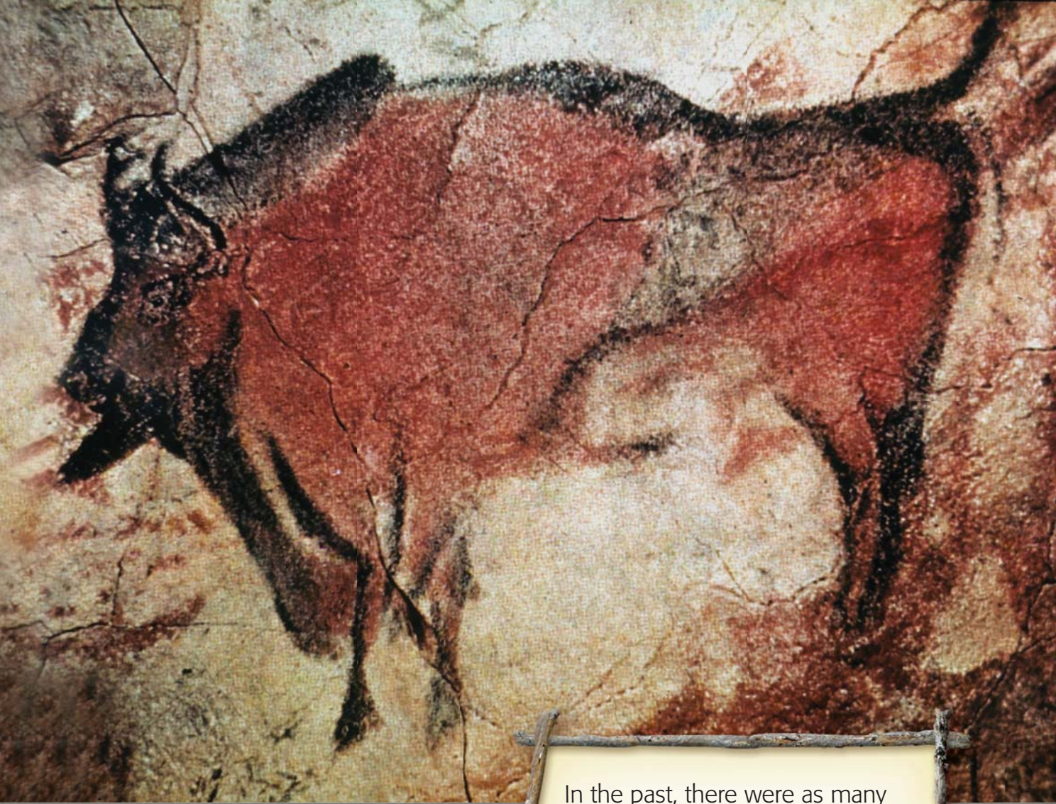
A bison drawing found in a cave

Scientists don't know exactly how many bison there were. It's thought, however, that at one time 30 to 60 million lived in North America.