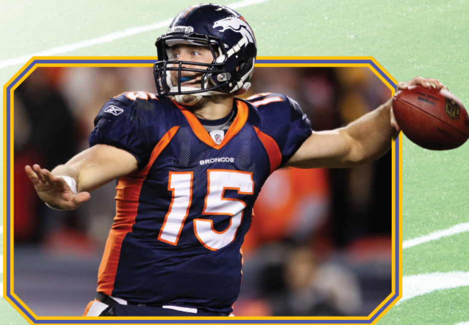
Tim Tebow looks to pass the ball to Demaryius Thomas on January 8, 2012.

When overtime began, it was the Broncos’ star who shined brightest. On the very first play, Tim launched a pass straight downfield to receiver Demaryius Thomas. Demaryius sped into the end zone for the game-ending touchdown. Tim’s magical pass seemed like a miracle!