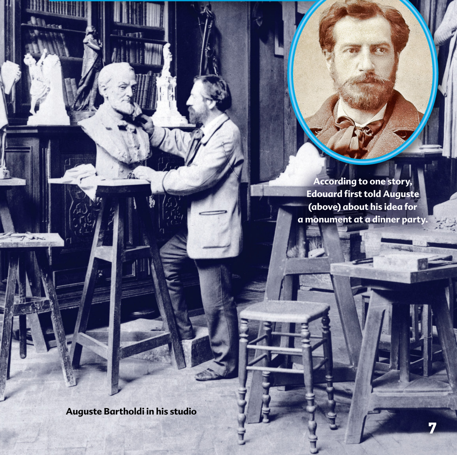
Auguste Bartholdi in his studio