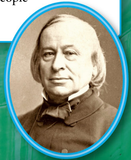
Edouard de Laboulaye

Where had the majestic statue come from, and who had built it? Edouard de Laboulaye, a French law professor, first dreamt up the idea to build the monument . Edouard admired American democracy because people were free to choose their leaders. In France, where Edouard lived, the people didn't have a choice. So Edouard had an idea—France should build a huge monument in the United States that celebrated democracy and liberty. Maybe it would inspire the French people to create their own democracy!