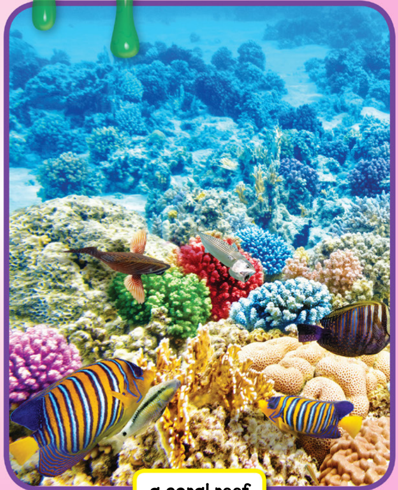
a coral reef

A coral reef is made up of millions of tiny animals called coral polyps (POL-ips). When these polyps die, their skeletons are left behind, forming the rocklike reef.