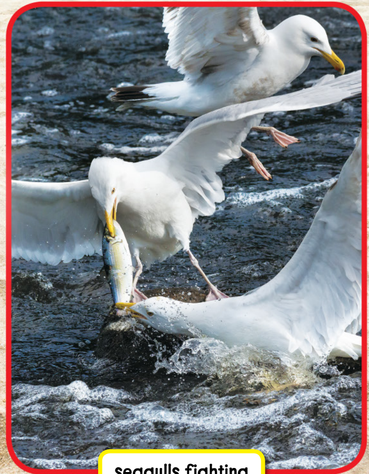
seagulls fighting over a fish

When their fishy feast is over, they fly back to the beach to rest.