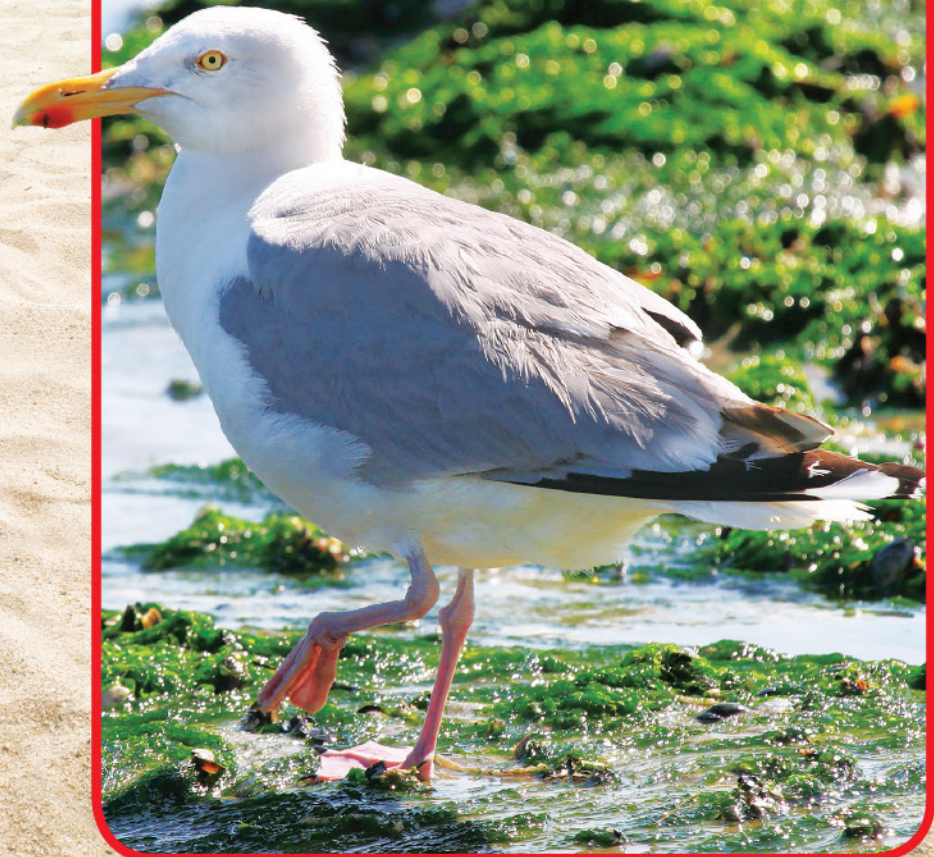
adult herring gull

Seagulls spend their days looking for food, bathing in the sea, and resting on rocks.