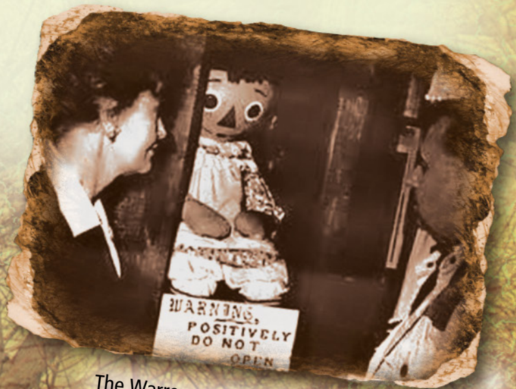
The Warrens and Annabelle, the doll

Visitors to the Warrens' Occult Museum can view Annabelle in a glass box. A sign warns people to absolutely not open the case . . . or else.