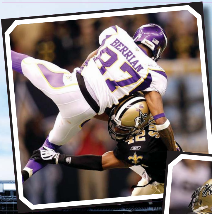
Safety Darren Sharper (#42) of the New Orleans Saints hits Bernard Berrian (#87) of the Minnesota Vikings.

This book features the talented athletes who play at the different defensive positions. You will learn about linebackers such as Elvis Dumervil and Patrick Willis, who put nonstop pressure on the quarterbacks. You will meet cornerbacks and safeties such as Darren Sharper, Darrelle Revis, and Charles Woodson, who keep receivers from catching passes. You will also discover the powerful players of the defensive line such as Jared Allen, Dwight Freeney, and Haloti Ngata. Each one is a star of the defense!