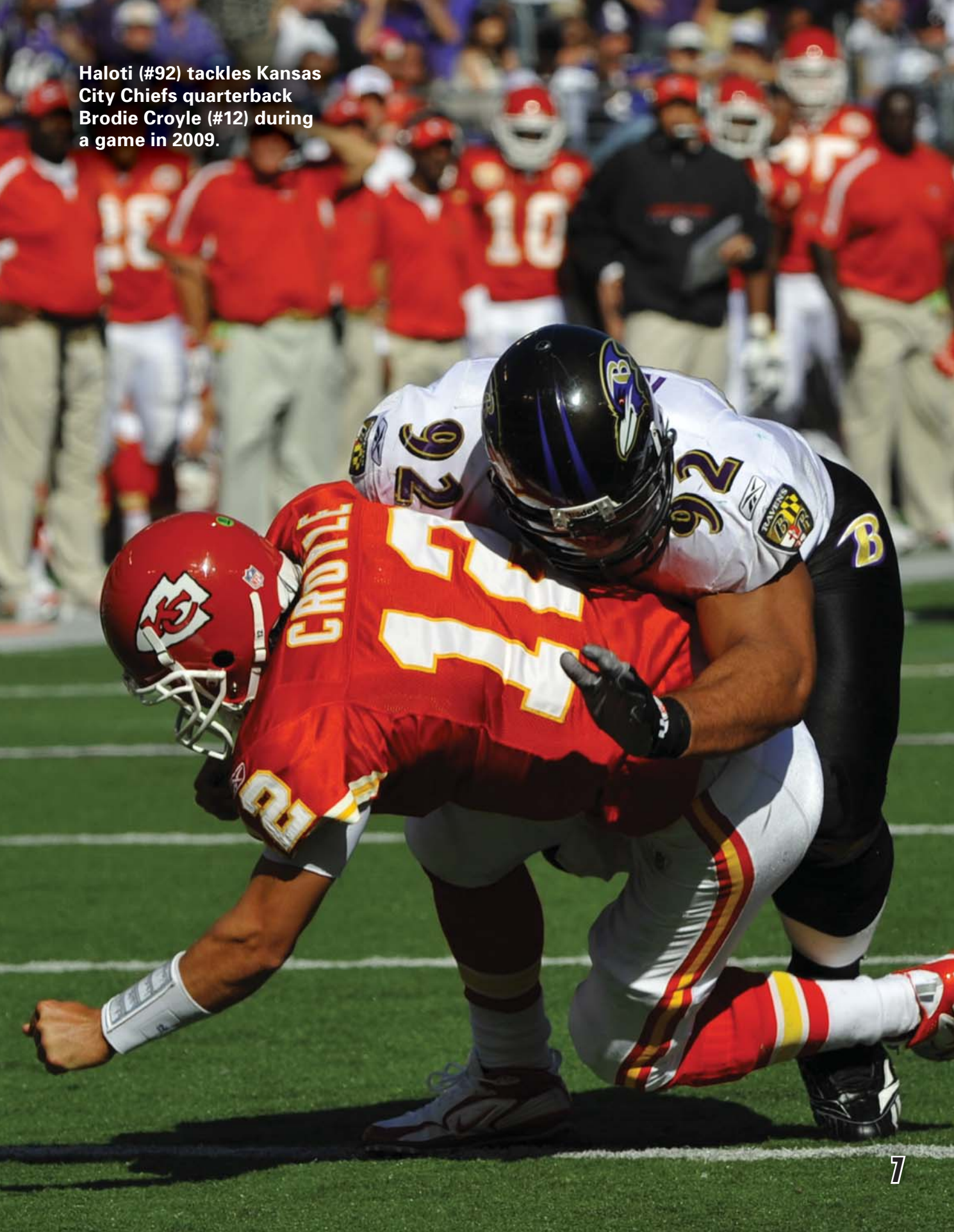
Haloti (#92) tackles Kansas City Chiefs quarterback Brodie Croyle (#12) during a game in 2009.