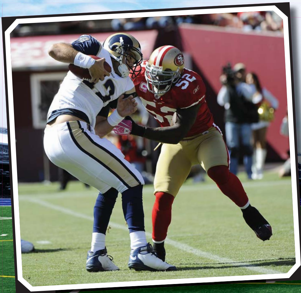
San Francisco 49ers linebacker Patrick Willis (#52) sacks quarterback Kyle Boller (#12) of the St. Louis Rams.

The league's greatest defenses are built around star players who excel at their jobs. By stopping the run and shutting down the pass, these defensive players make it nearly impossible for the other team to gain yards or score points.