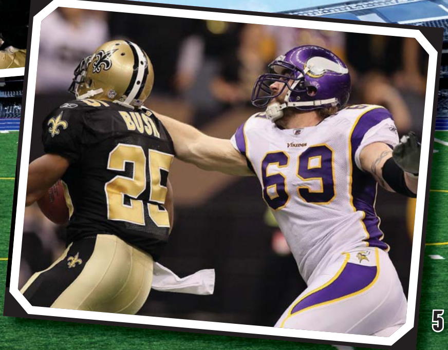
Minnesota Vikings defensive end Jared Allen (#69) grabs Reggie Bush (#25) during a game against the New Orleans Saints.