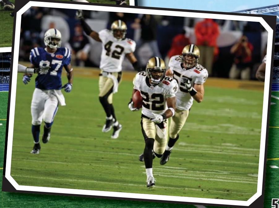
New Orleans Saints cornerback Tracy Porter (#22) runs for a touchdown during Super Bowl XLIV (44).