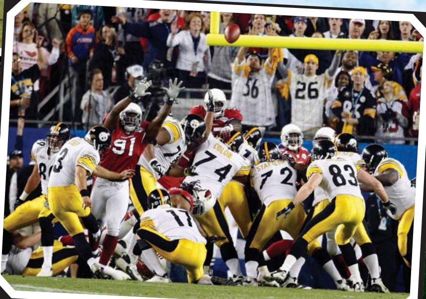
Pittsburgh Steelers kicker Jeff Reed (#3) kicks a field goal as his teammates hold back the Arizona Cardinals during Super Bowl XLIII (43).