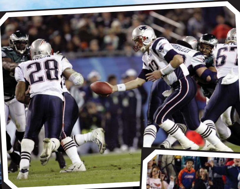
New England Patriots quarterback Tom Brady (#12) hands off the ball to running back Corey Dillon (#28) during Super Bowl XXXIX (39).

In the NFL, success can come quickly, but it can also disappear just as fast. One season, a team may be a Super Bowl contender . The next, it might not even make the playoffs. Injuries and free agency are two reasons why keeping a winning group together isn't easy.