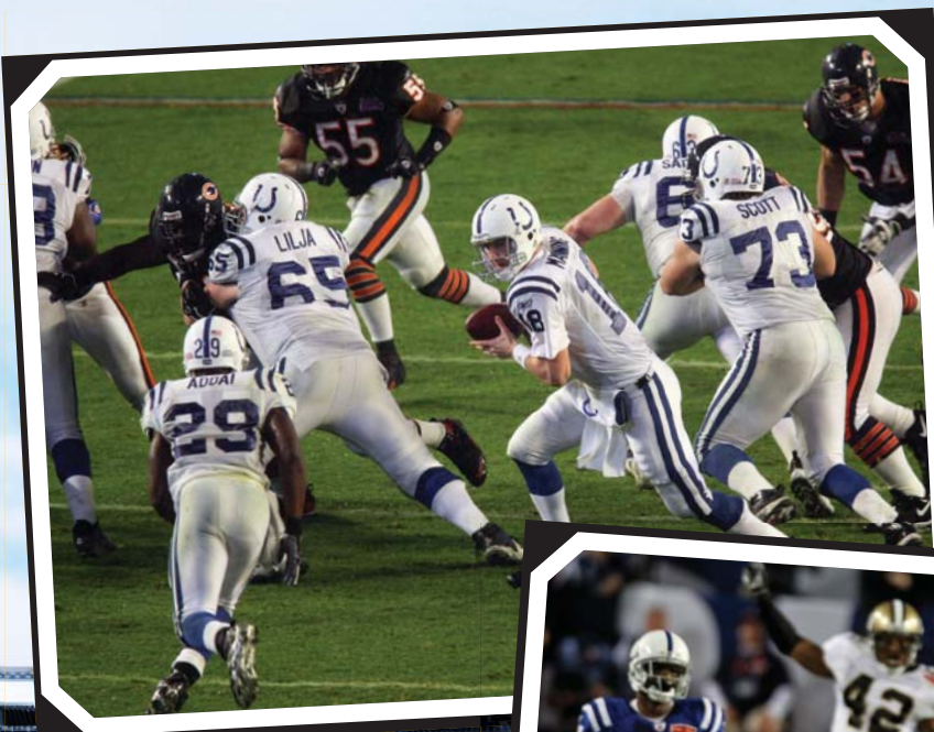
Quarterback Peyton Manning (#18) looks to hand off the ball to Indianapolis Colts running back Joseph Addai (#29) during Super Bowl XLI (41).

A few franchises , however, have found the secrets to long-term success—winning combinations of players, coaches, and strategies . Year after year, these teams are always right at the top of the pack. In this book, you will read about four of these clubs—the New England Patriots, the Pittsburgh Steelers, the Indianapolis Colts, and the New Orleans Saints. It will be easy to see why they have ruled the league for the last decade and are considered the dream teams of the NFL.