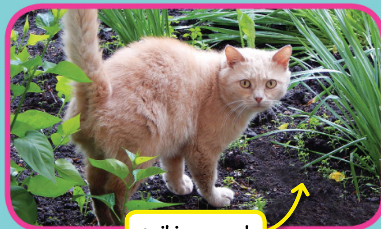
soil in a yard

So where does soil come from, and what is it made of? Let's find out!