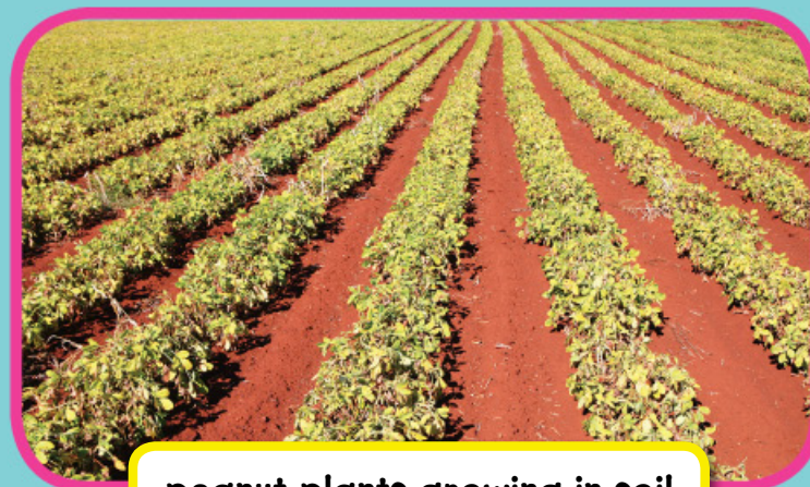
peanut plants growing in soil