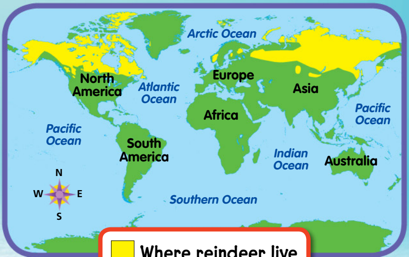
Where reindeer live