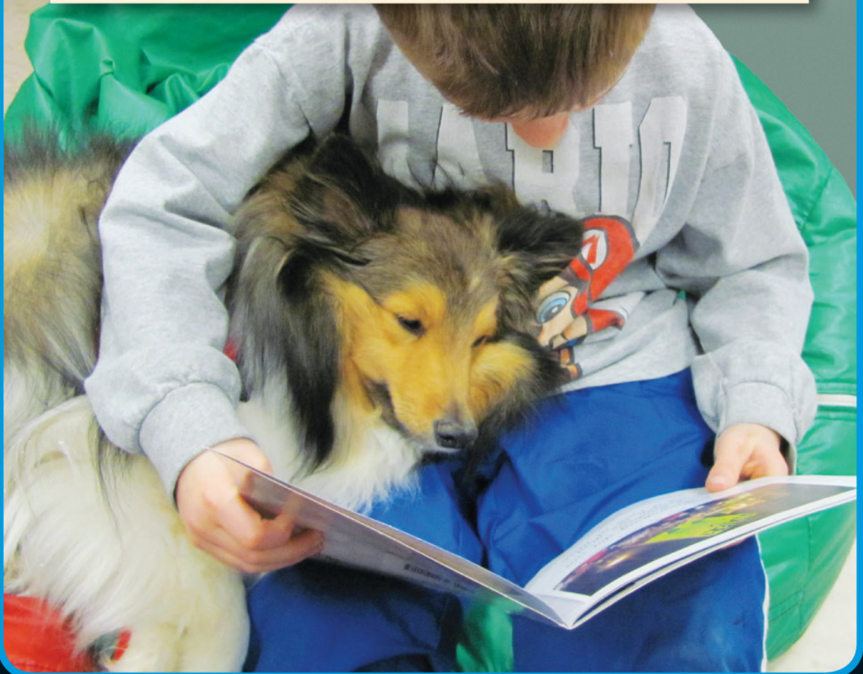
Kaila looks at a book as a young student reads to her.