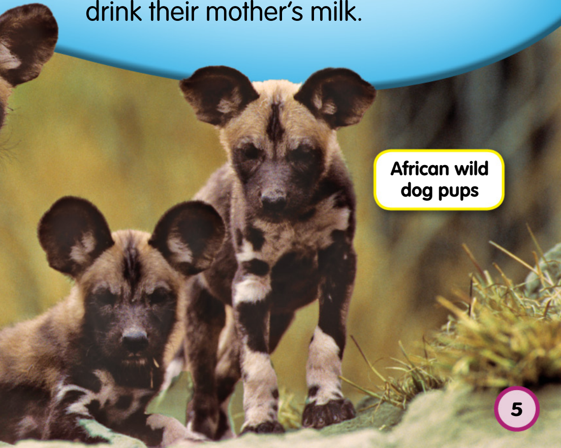
African wild dog pups

The young pups will stay home and drink their mother's milk.