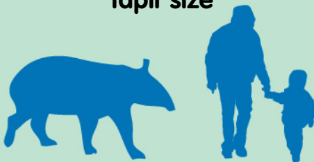
Adult South American tapir size

Tapir calves have white stripes and dots on their fur when they are born.