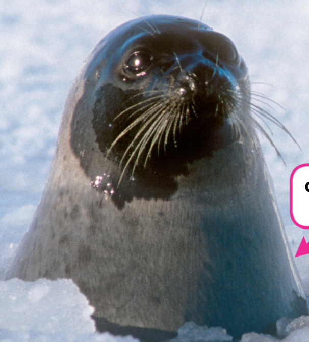
adult harp seal