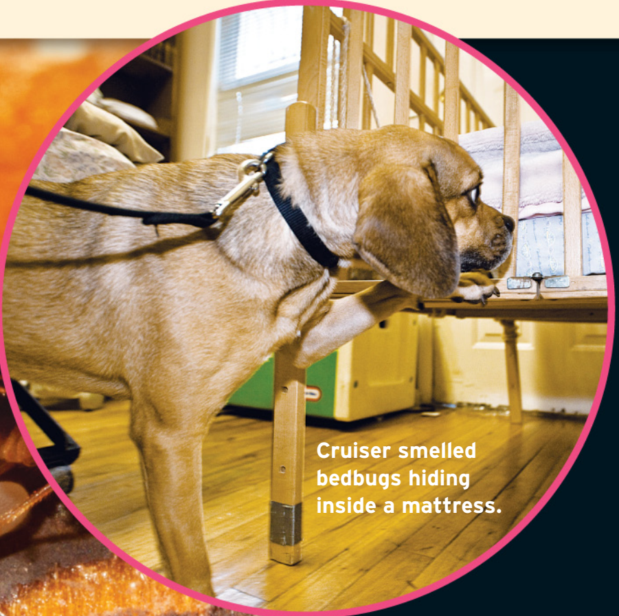
Cruiser smelled bedbugs hiding inside a mattress.

Cruiser sniffed a wooden crib in one of the children's rooms. He pawed at the mattress. It was his way of saying, "I smell bedbugs here." The mother was upset but also grateful. Thanks to Cruiser, the insects could now be exterminated . They would not be moving with the family into their new home.