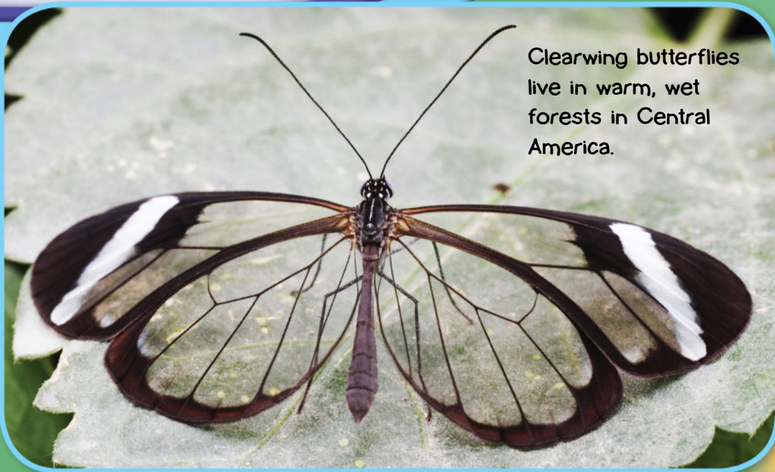
Clearwing butterflies live in warm, wet forests in Central America.

The butterfly's transparent wings make the insect hard to see when it is keeping still. For example, when it is resting on a leaf or sipping the nectar that it feeds on from a flower, the clearwing is nearly invisible. The butterfly is also hard to see when it is in flight. That's even more important for its survival, since birds often spot and snatch butterflies as the insects move their wings to flutter through the air.