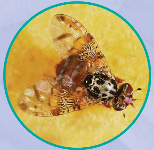
▲ A Mediterranean fruit fly

In 1997, Florida spent $25 million trying to get rid of Mediterranean fruit flies near the city of Tampa Bay.