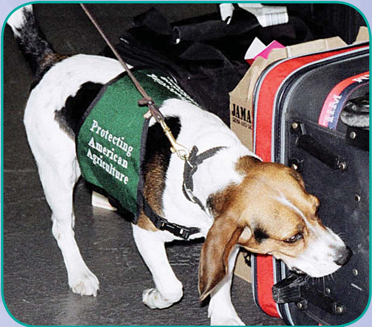
▲ Trouble at work at Miami International Airport in 2004

Suddenly, a worker named Trouble sat down in front of a suitcase. He didn't like what he had just discovered.